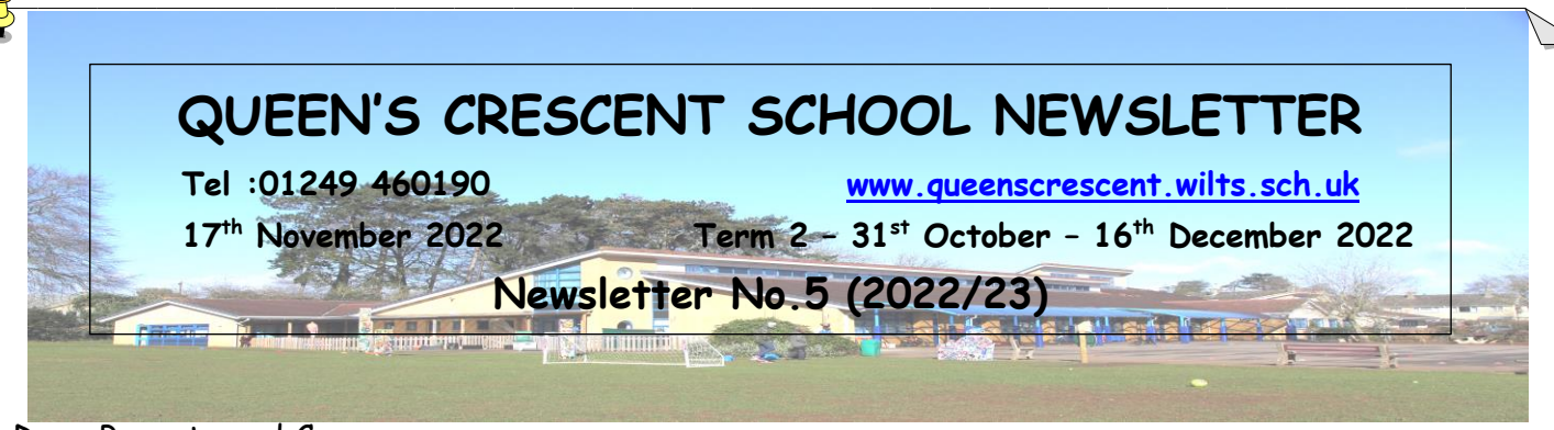
Dear Parents and Carers,

We are full steam ahead this term with lots of learning taking place across the school. Despite only being back for 3 weeks, there have been plenty of enhanced learning opportunities taking place across the school.